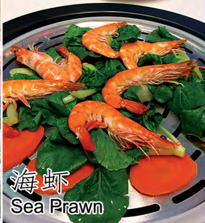
海虾 Sea Prawn