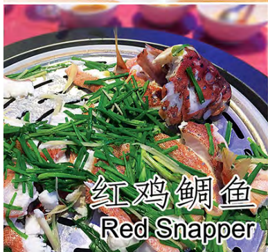
红鸡鲷鱼 Red Snapper