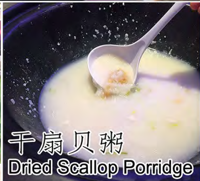
干扇贝粥 Dried Scallop Porridge