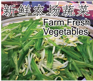
新鲜农场蔬菜 Farm Fresh Vegetables