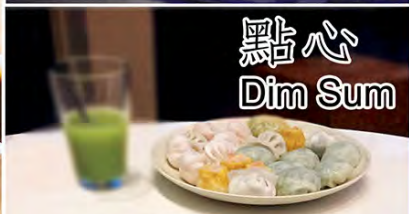
點心 Dim Sum