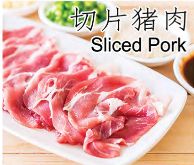
切片猪肉 Sliced Pork